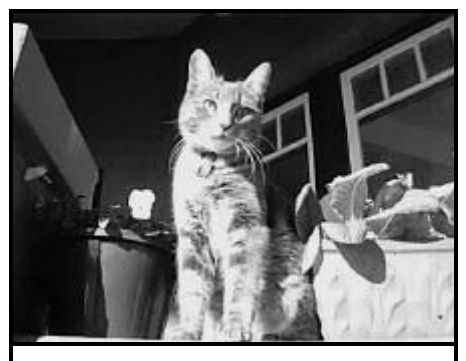
Ardoch's best known (and best fed) identity?

thority (EPA) legislation still covers excessive noise—of all types!